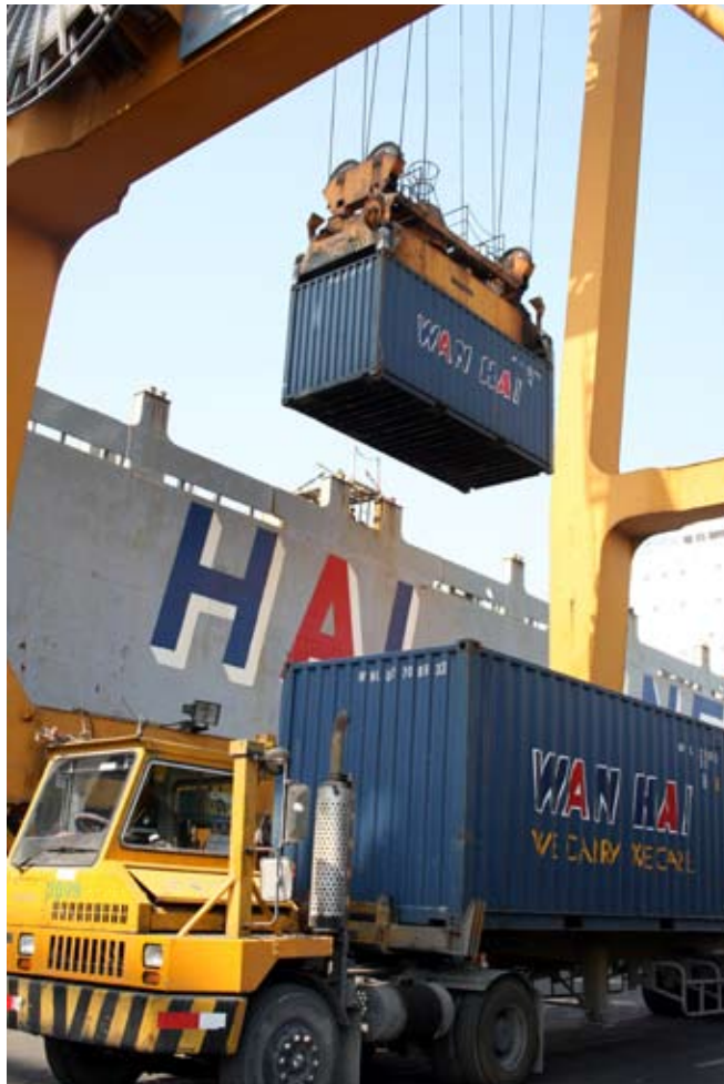
When demand and prices are falling - like today - it's all about leveraging competition.

The RFQ is so quick and easy that it's hard to figure out why not to send one out today. Some ocean freight rates have dropped more than 80%. Charter rates have been hit hardest, especially in bulk trades, but even liner rates are bargains. Carriers are laying up hundreds of ships. Whenever